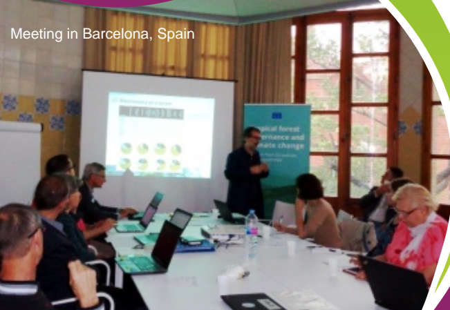
Meeting in Barcelona, Spain

Project co-funded by H2020 Programme under Grant Agreement n° 727486